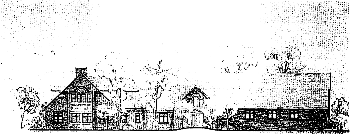
Cedar Street Elevation

Duxbury Clipper, Wednesday, March 6, 1996